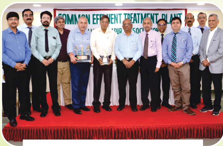
CETP Board of Directors along with TBIA office bearers.