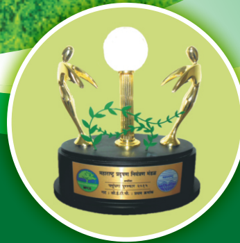
वसुंधरा पुरस्कार २०१९