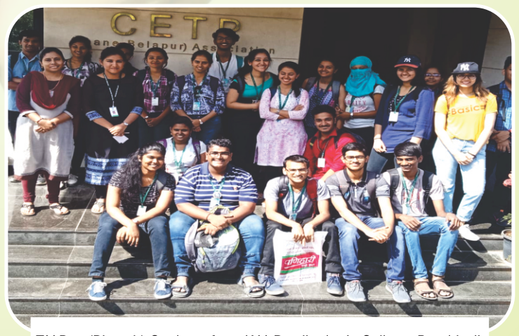
T.Y Bsc (Biotech) Students from K.V. Pendharkar's Collage, Dombivali.