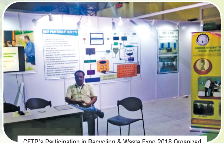
CETP's Participation in Recycling & Waste Expo 2018 Organized by NMMC at Nerul, Navi Mumbai.