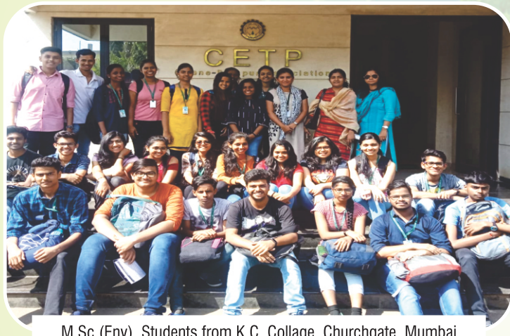
M Sc (Env) .Students from K.C. Collage, Churchgate, Mumbai