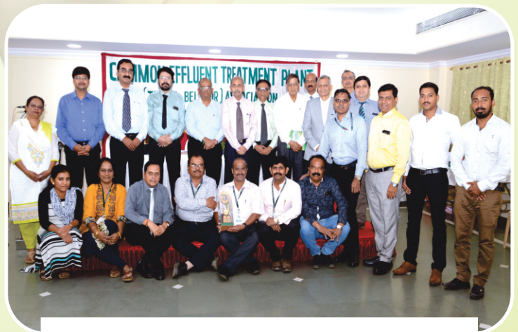
CETP Board of Directors and Staff along with TBIA office bearers.