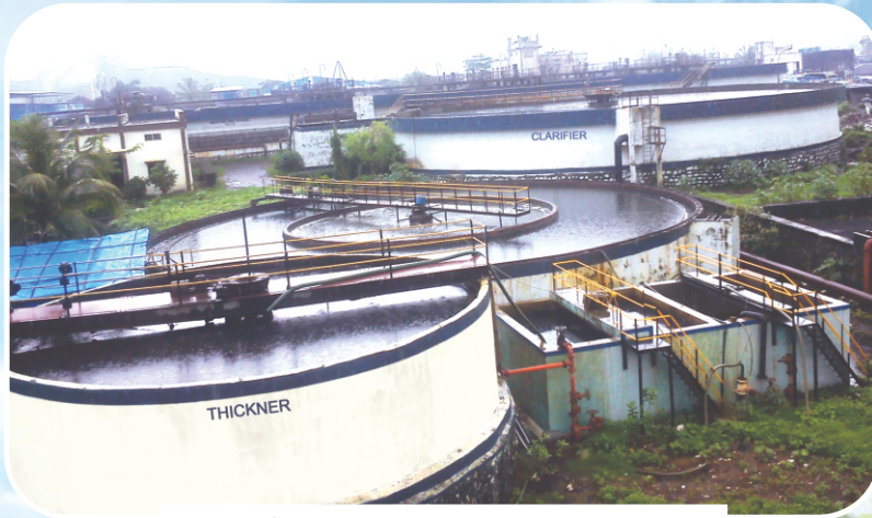
Primary Treatment Process

“Be a Part of the Solutions Not Part of the Pollution. ”