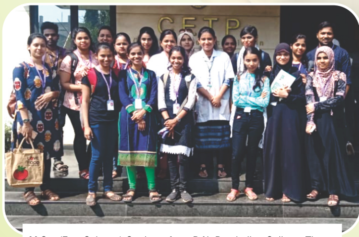
M Sc. (Env. Science) Students from B.N. Bandodkar Collage, Thane.