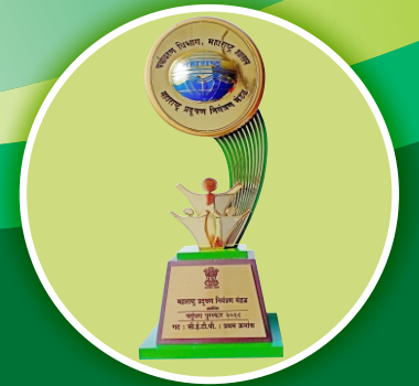
वसुंधरा पुरस्कार २०१८

Address : Plot No. P-60, Thane-Belapur Road, Khairane, MIDC, Navi Mumbai - 400 710. Tel.: 022-27615582 / 022-27631724 E-mail: cetpttc@gmail.com | Website : www.cetpttc.org