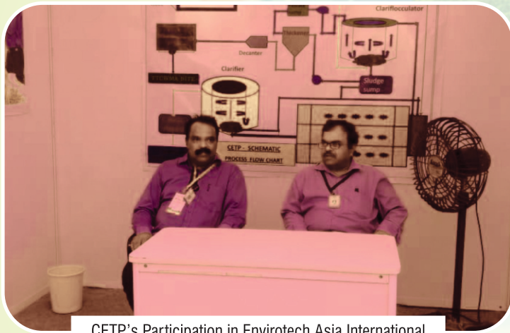
CETP's Participation in Envirotech Asia International Exhibition 2018 at Goregaon, Mumbai.