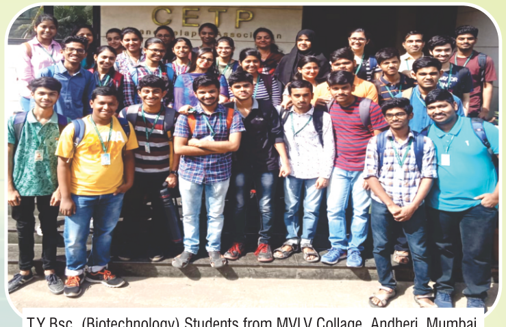
T.Y Bsc. (Biotechnology) Students from MVLV Collage, Andheri, Mumbai.