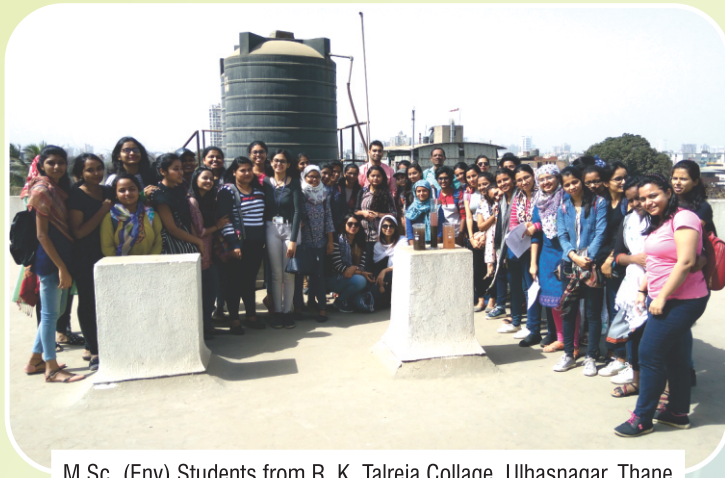
M Sc. (Env) Students from R. K. Talreja Collage, Ulhasnagar, Thane